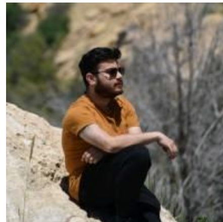
Manabputra (UW Madison) Focused Optical Illumination of Superconducting Qubit Arrays: Substrate Charge Dynamics